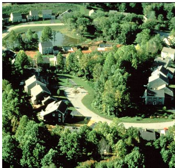
Figure 5.2. Cluster Development