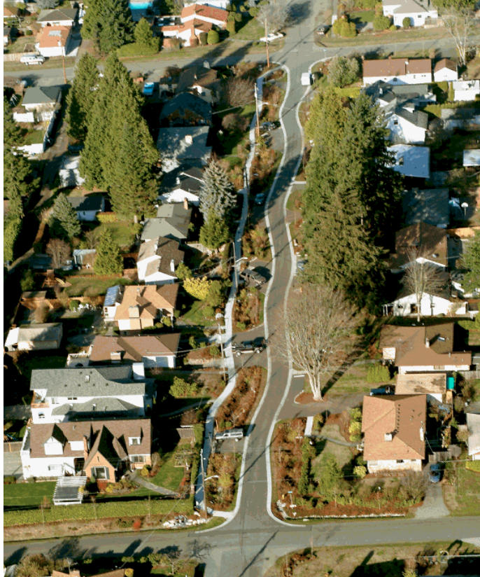
Figure 5.3. Green Street Design for 110 th Street, Seattle, WA

In the past, using these kinds of site design techniques, such as preserving open space to reduce runoff volume, did not translate into any kind of economically tangible credit for developers in Virginia. However, that is no longer true. Runoff volume calculations using the new Runoff Reduction Method (discussed below) will generate smaller amounts of site runoff where land cover is preserved that produces less runoff. This will translate into fewer and/or smaller BMPs needed on the site to manage the runoff. Chapter 6 will provide more specific guidance about Environmental Site Design techniques.