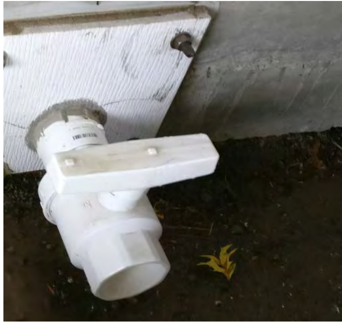
Figure 3. Filter Panel Valve.