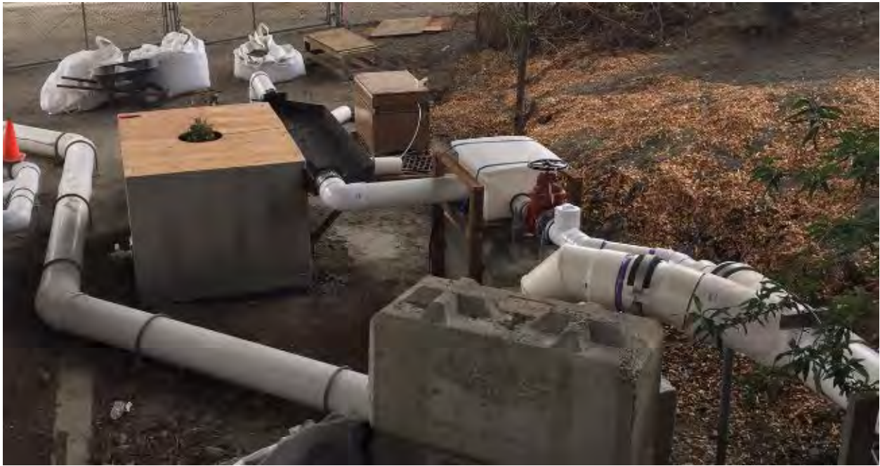
Figure 1. Image of the StormGarden System Tested at the SCTF.