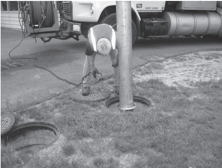
A Cascade Separator unit can be easily cleaned in less than 30 minutes.