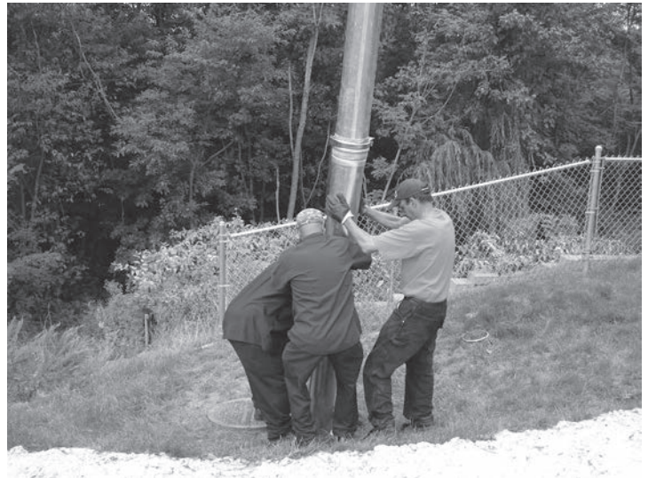
A vacuum truck excavates pollutants from the systems.